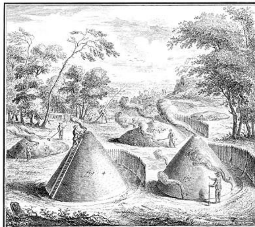
Fol. I, Oeconomie rurale, Charbon de Bois, Pl. II.