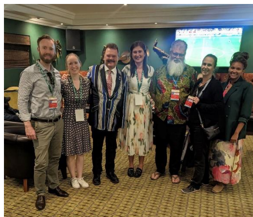
The Uppsala University team at SANORD at the University of Limpopo in December 2022

The LACET has quickly emerged as one of the most dynamic research networks in West Africa. It allows Uppsala University to play a key role in fostering research and research training in innovative ways, as a way to work to decolonize research and higher education.