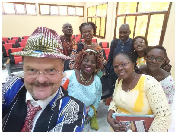
LACET Members participated in the workshop on Burkina Faso seen from below in June 2022.

The LACET functions as an umbrella and academic framework, as to formalize and foster stronger bonds and better opportunities between researchers and institutions, while staying flexible and open to any collaboration with other actors. Since 2019, the LACET is established as an international research laboratory called Le Laboratoire d'Anthropologie Comparative, Engagée et Transnationale .