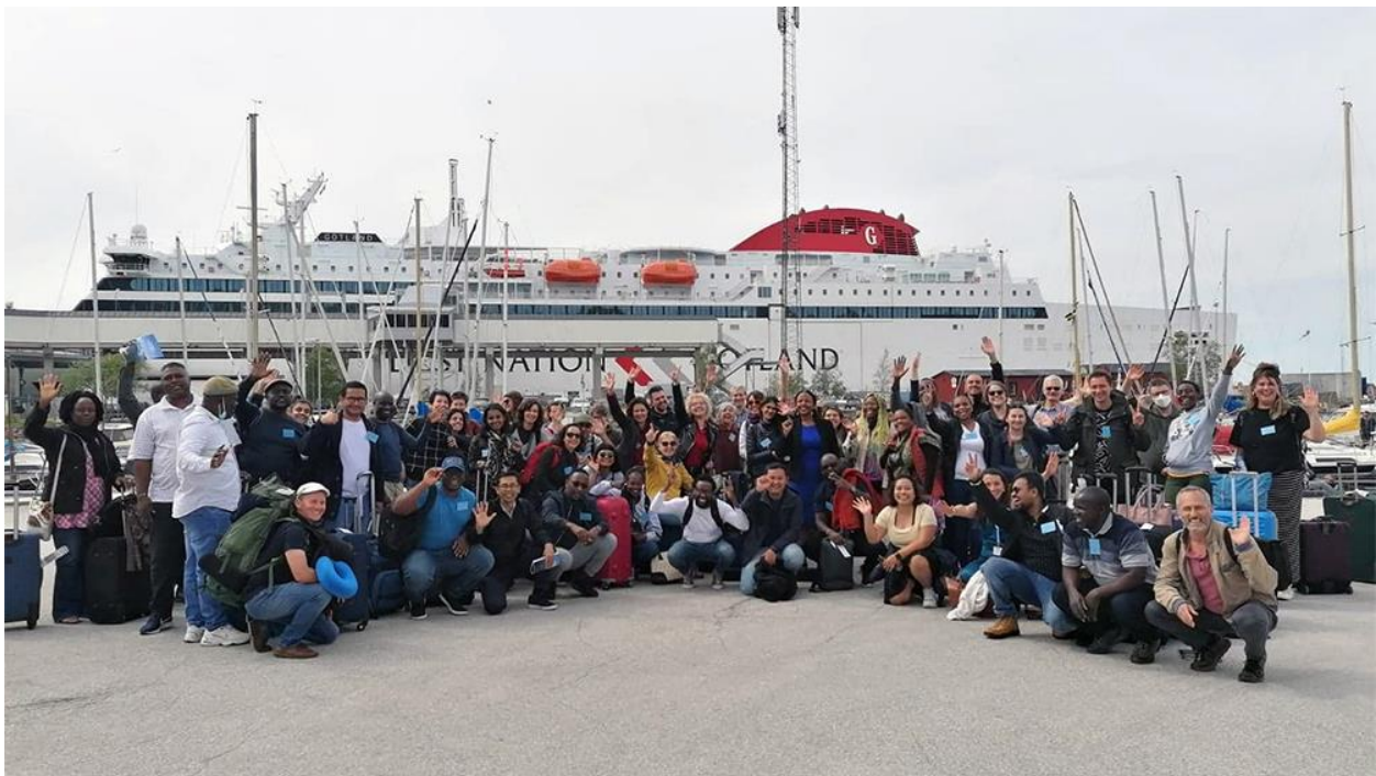
Participants of the Local Democracy Academy arriving in Visby on 6 June 2022.

Between 6 and 10 June, the Swedish International Centre for Local Democracy (ICLD) and the Forum for Africa Studies co-hosted the conference Local Democracy Academy – connecting research and practice , at Uppsala University's Campus Gotland. Some 70 researchers from 50 universities in 30 countries attended. The theme was “Transformative local governments: bringing people and politics together.” Read more here