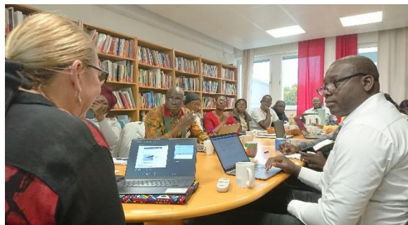
Seminar at Stockholm University as part of the Launching Seminar on Decolonizing Research Methodologies (above). The Bursvik team visiting the Southern tip of Gotland (right).

The Launching Seminar of the Research School Programme Decolonizing Research Methodologies aimed to bring together participants from the six partner universities: Université Nazi Boni, Burkina Faso; Institut des Sciences Humaines, Mali; University of Dar es Salaam, Tanzania; Swedish University of Agricultural Sciences, Sweden; Stokholm University, Sweden; and Uppsala University, Sweden. In total, the Seminar included 25 participants from seven African countries (Appendix 5). The Seminar consisted of 15 days of intense course on decolonization in practice and on fieldwork methodology. It was exploratory in the sense that PhD-students, postdocs, and faculty engaged in a training and learning process that aims to develop courses and curricula of the programme's coming field courses. Seminar, lectures, round-tables, workshops, walk-and-talks, were all combined with fieldwork in four Gotlandic parishes: Burgsvik, Klintehamn, Östergarn, and Fårösund.