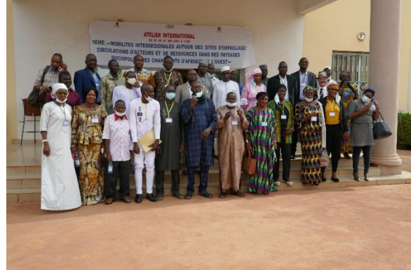
Photo de famille at the West Africa Workshop in Bamako, Mali, in May 2021.

The LACET has quickly emerged as one of the most dynamic research networks in and on West Africa. It allows Uppsala University to play a key role in fostering research and research training in innovative ways, as a way to practically and concretely work to decolonize research and higher education.