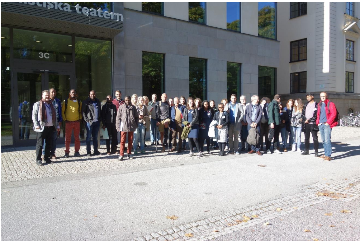
Participants of the 13 th European Summer School for the Anthropology of Development and Social Dynamics.

Partner universities are: Université d'Aix Marseille (France); University of Bayreuth (Germany); Université de Bordeaux (France); Université Libre de Bruxelles (Belgium); University of Copenhagen (Denmark); University of Edinburgh (United Kingdom); University of Leipzig (Germany); KU Leuven (Belgium); Université de Liège (Belgium); Université Catholique de Louvain/UCL (Belgium); Johannes Gutenberg-University of Mainz (Germany); Ecole des Hautes Études en Sciences Sociales Marseille (France); Ecole des Hautes Etudes en Sciences Sociale/EHESS Marseille (France); Roskilde University (Denmark); and Uppsala University (Sweden).