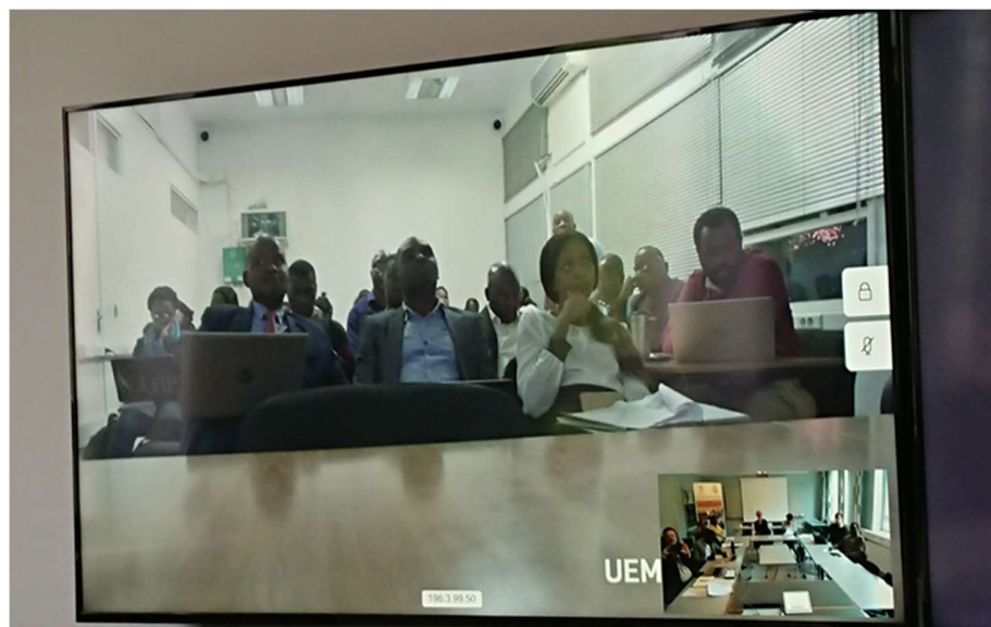
The first UU/UEM Virtual Seminar was launched on 25 February 2019.