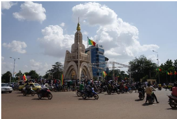
The engaged research on the Malian crisis focused, amongst other things, on its epicenters, including the Independence Square in the center of Bamako.

In total, LACET hosted three virtual seminars, and five in situ seminars and workshops during the year. The virtual seminars are attended by people across Africa and Europe with up to 40 participants each time. Seminars and workshops in situ and in persona have been attended by 50 to 100 people each.