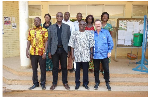
The LACET Burkina Faso team met at the Nazi Boni University of Bobo-Dioulasso.

The LACET has quickly emerged as one of the most dynamic research networks in and on West Africa. It allows Uppsala University to play a key role in fostering research and research training in innovative ways, as a way to decolonize research and higher education.