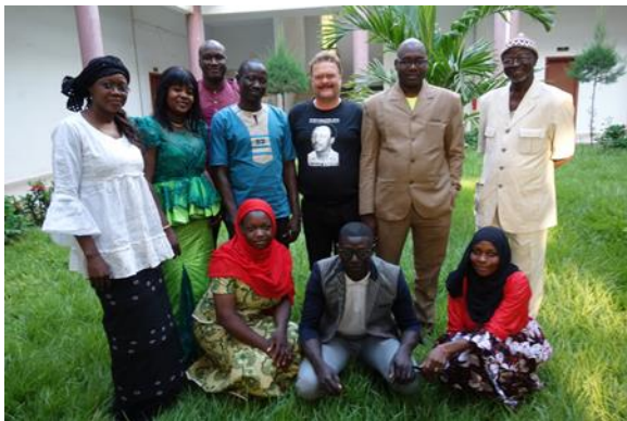
The LACET Mali team that carried out research on the 2020 Malian Crisis.