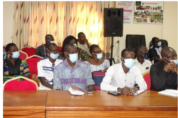
The LACET Seminar in Bobo-Dioulasso in November 2020 around the book Security from below in Burkina Faso drew some 70 participants.