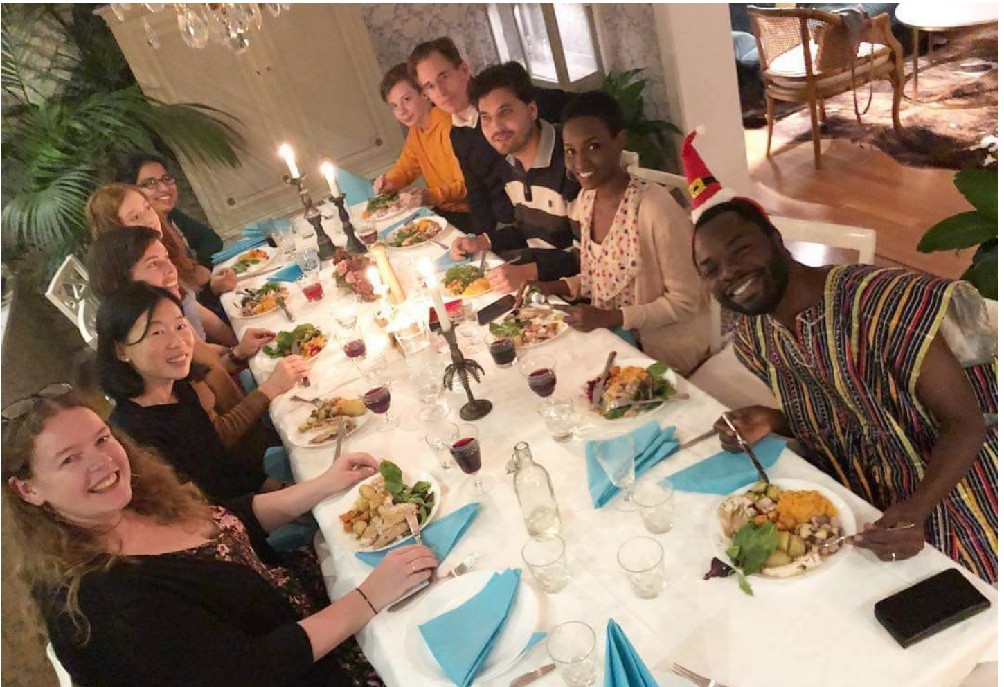
Class XVII Peace Fellows enjoy a Thanksgiving dinner together with Rotary hosts.

The generosity of Rotary can only be compared to the hospitality and overall support we have received from the local Rotarians since we arrived in Uppsala. Thank you for making Sweden our home and Rotary our extended family.