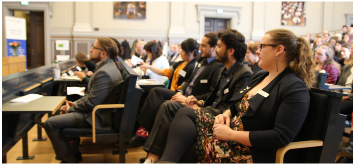
Above: The Seminar brought together a diverse audience from Sweden and around the world: practitioners, faculty and students, and Rotarians interested in peace work and research.

On 4 May, the Uppsala Rotary Peace Center welcomed guests to the Uppsala University Main Building for the sixth Annual Seminar. The Annual Seminar is organized by the Uppsala Rotary Peace Center at the Department of Peace and Conflict Research to highlight the work of the graduating Rotary Peace Fellows.