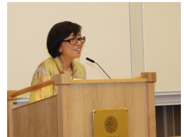
Above: panel discussions and the keynote address.