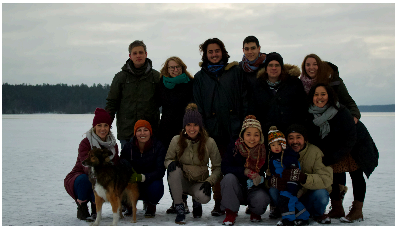
Fellows class XVI enjoying Swedish winter at lake Mälaren in Sunnersta.