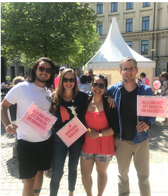
Fellows from class XVI actively participated at the Womens March at Stockholm.